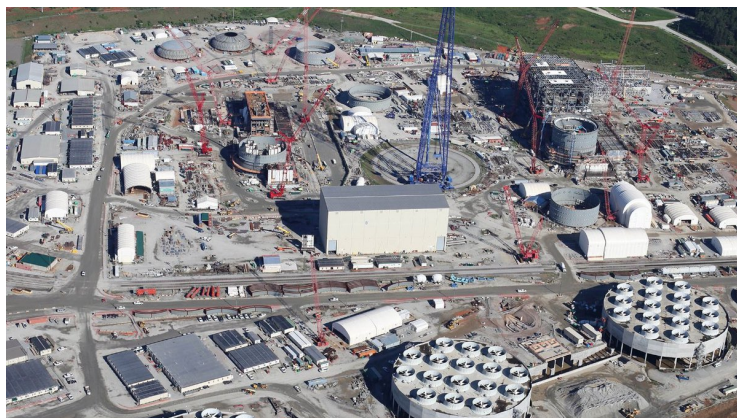
The abandoned V.C. Summer nuclear project in South Carolina. A number of utility and company executives have been charged with crimes – this is known as the 'Nukegate' scandal. 292

* France: The latest cost estimate for the one and only reactor under construction is €19.1 billion (A$31.0 billion) or €11.9 billion ($A19.4 billion) / GW. 291