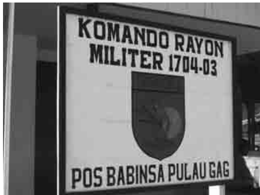
THE LOCAL VILLAGE HEAD, LOCAL VILLAGERS AND BHP BILLITON EMPLOYEES ARE ALL UNDER THE IMPRESSION THAT BHP BILLITON PAID FOR MATERIALS USED TO CONSTRUCT THIS MILITARY POST. THE INDONESIAN SECURITY FORCES HAVE A HISTORY OF HUMAN RIGHTS VIOLATIONS AROUND MINING PROJECTS IN WEST PAPUA AND INTIMIDATION OF THOSE OPPOSED TO MINING.

BHP Billiton's interest in Raja Ampat dates back to 1995. In 1998 the company signed a contract of work over Gag Island, arguably one of the world's most lucrative nickel laterite deposits. In 1999, the then Indonesian Minister of the Environment declared Gag Island a protected forest as part of the Forest Act. But in 2004, companies which had secured leases before promulgation of the Act were permitted to resume exploration in 13 areas, including Gag Island. 23 BHP Billiton did resume exploration. Pressed repeatedly at company AGMs to clarify BHP Billiton's intentions on Gag Island, company Chairman Don Argus pointedly refused to admit that the company should never have been on the island in the first place, and particularly not after the passage of the 1999 forest law. The company was accused of lobbying the Indonesian Government to water down the 1999 Act. BHP Billiton never developed its planned nickel mine and in No-