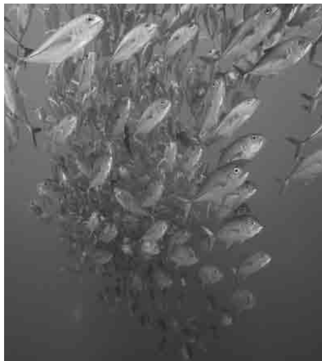
BIG EYE TUNA. RAJA AMPAT IS THE HEART OF THE WORLD'S BREEDING GROUND FOR TUNA. IT IS ALSO THE MOST DIVERSE MARINE ENVIRONMENT OF THE PLANET.

practice has already been discouraged by the Asian Development Bank, which requested BP not to route its gas tankers through the Raja Ampat archipelago in order to service the Tangguh Natural Gas Project in Bintuni Bay.