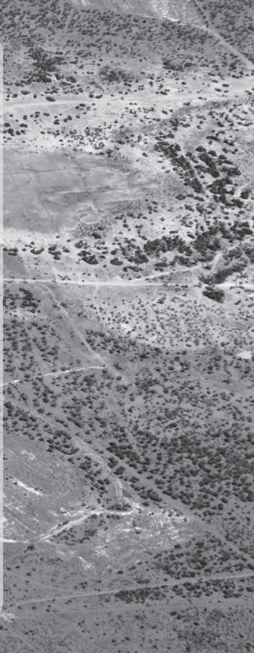
photo: Aerial photo of Yeelirrie – showing exploration drilling scar - April 2011.

Mia Pepper, Conservation Council of Western Australia