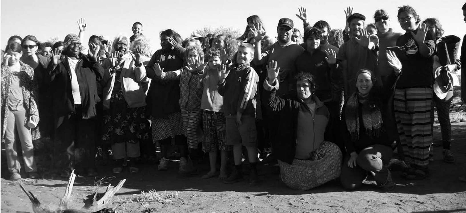
photo: Group photo next to the Yeelirrie exploration site; protesters walked to Yeelirrie from Wiluna as part of a 10 week "Walk Away From Uranium Mining" from Wiluna to Perth. Traditional Custodians of Yeelirrie welcome the walkers and their support to stop uranium mining at Yeelirrie.

In 2011 the Western Australia Labor party reaffirmed their opposition to uranium mining and strengthened their position by declaring that they will challenge any approved uranium mines. 76 Legal advice obtained by the current Western Australia liberal government on any future compensation