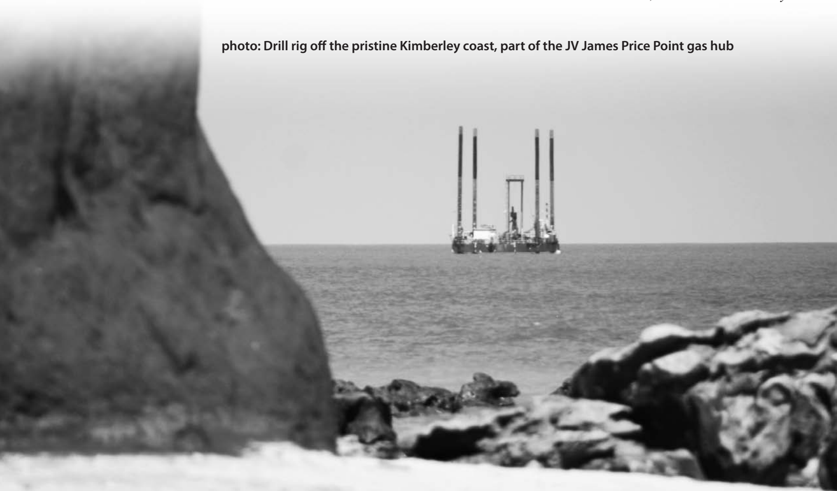
photo: Drill rig off the pristine Kimberley coast, part of the JV James Price Point gas hub